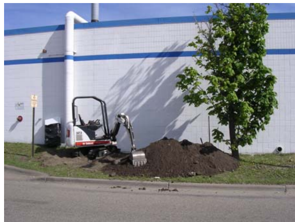
Excavation Site St. Paul, MN Climate Zone 1

Heat Flow Apparatus" immediately after excavation. Moisture content was determined by measuring the sample weight at the time of removal and again after being oven dried.